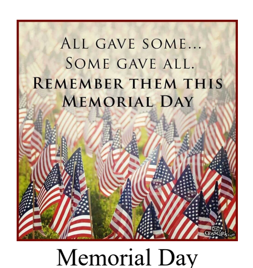
Monday, May 27th *there will be no evening services on Sunday, May 26th